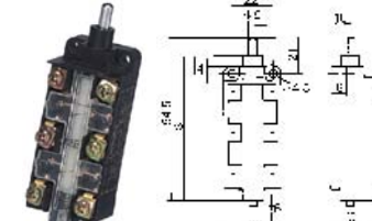
三极开启式行程开关 Open type limit switch with three poles